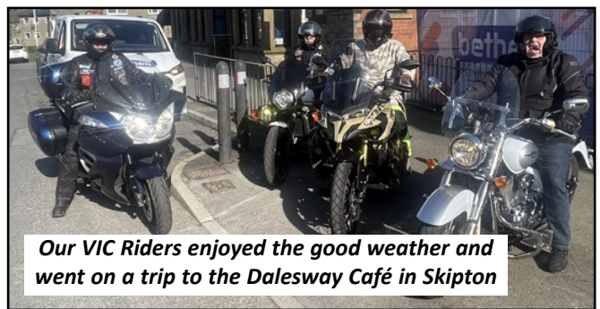
Our VIC Riders enjoyed the good weather and went on a trip to the Dalesway Café in Skipton