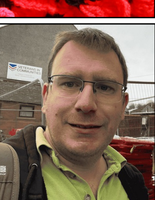
bers and then held a pop-up shop at Irwell Medical Practice, Bacup.

He learnt about the local issues with services and gathered stories from mem-