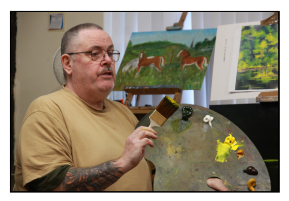
Centre line and shading for trees