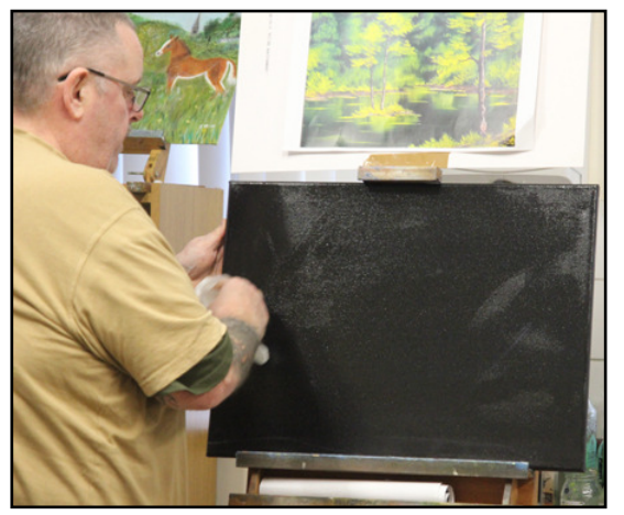
Criss crossing liquid clear