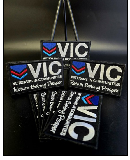
Fabulous high-quality embroidered patches are available at the VIC Centre prices £6.50 or £8 with post and packaging.