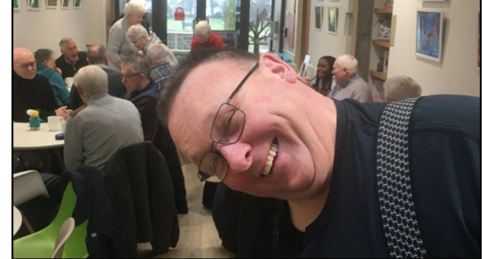
Our Redoubt Clitheroe coffee morning and quiz is proving extremely popular. Held in the community room of Trinity Methodist Church every Tuesday from 10am to noon, it is always well attended with lots of banter.

To sign up for free visit https://join.easyfundraising.org. uk