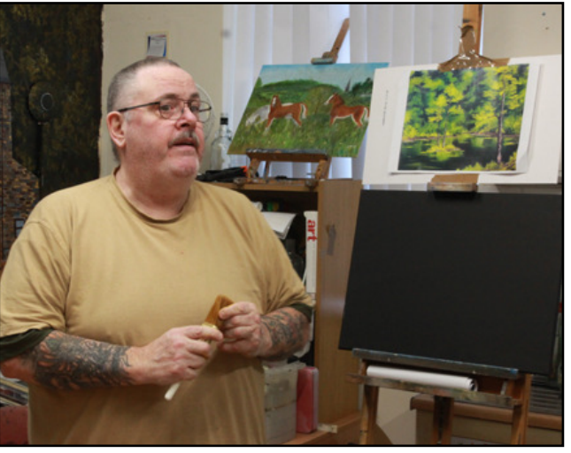
Everyone starts with a blank canvas